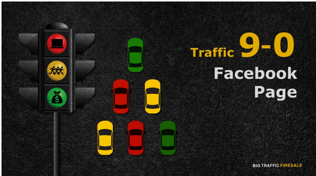
S1: Time to meet one of the biggest traffic generating giants – Facebook