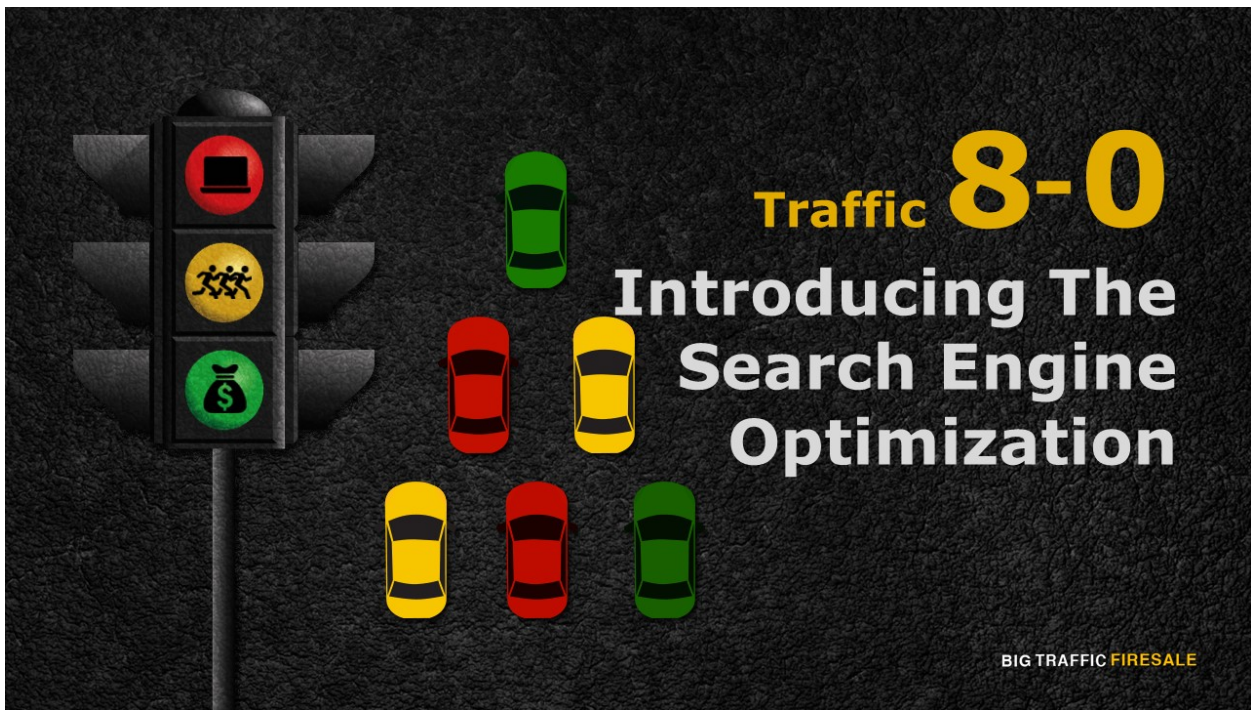
S1: Introducing the 'Search Engine Optimization', also known as, SEO.